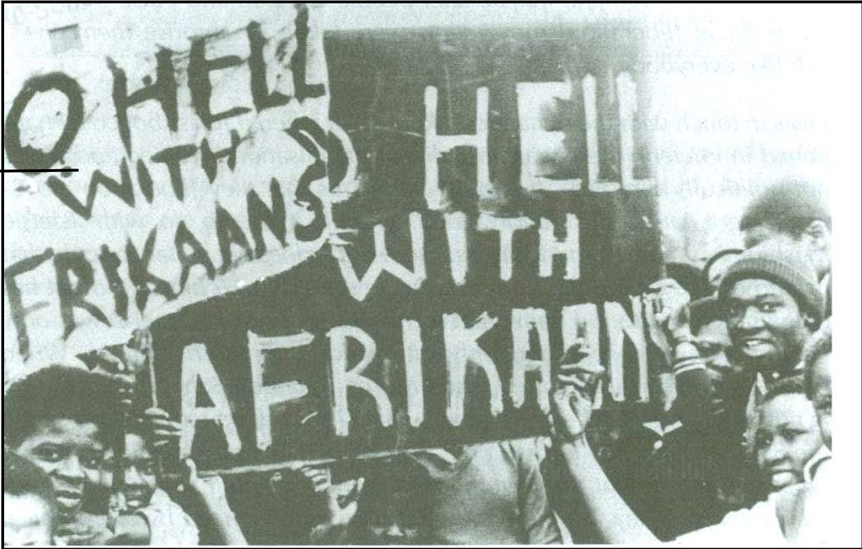
[From: The Soweto Uprising: Counter Memories of June 1976 by SM Ndlovu]

This photograph shows students from Soweto on 16 June 1976, protesting against the introduction of Afrikaans as a medium of instruction.