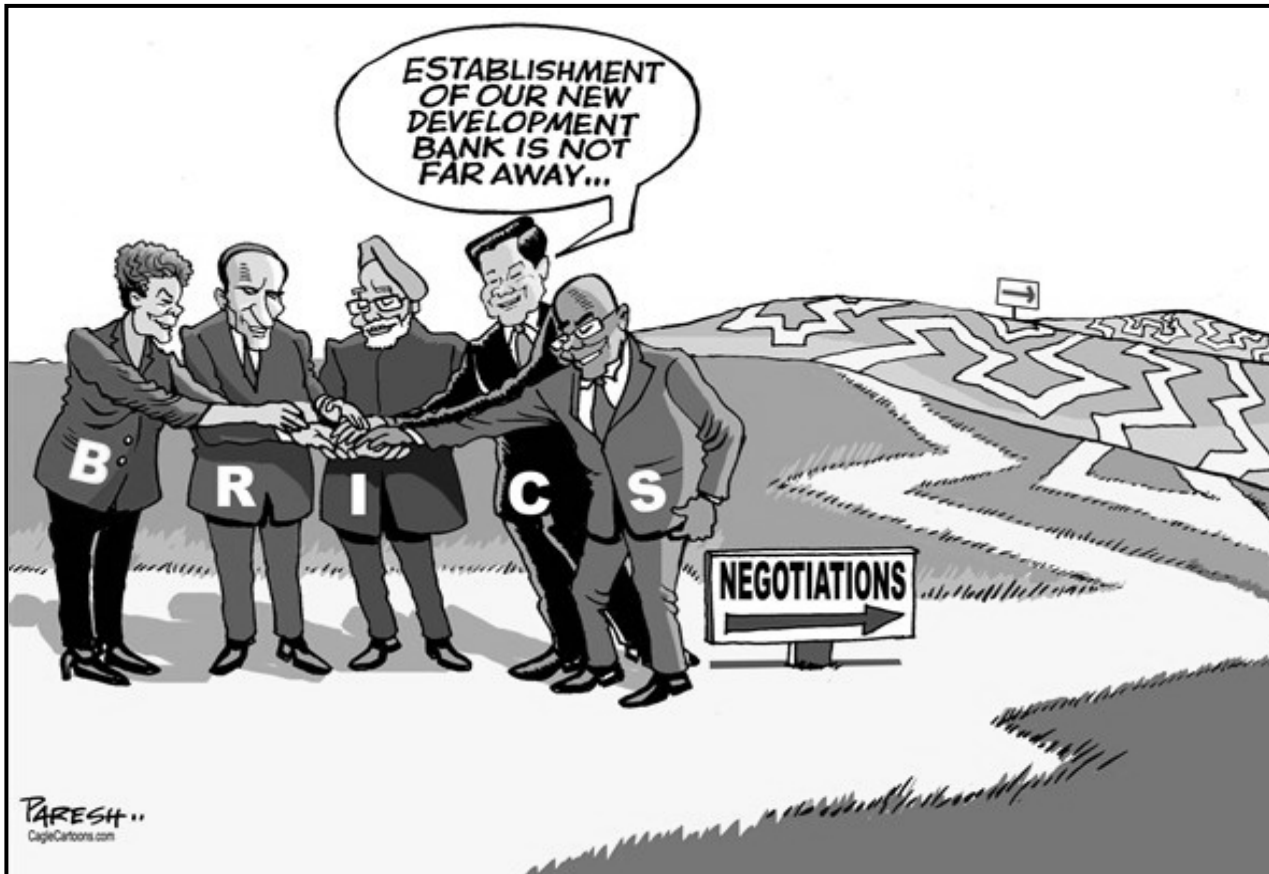
[From: www.cagle.com/2013/03/brics-development-bank . Accessed on 20 February 2015.]